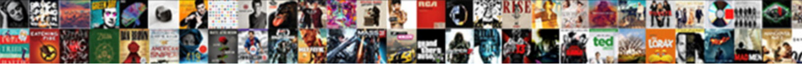
Tableau R Script Example